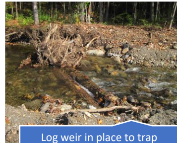
Log weir in place to trap sediment and raise stream bed.