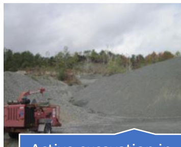
Active excavation in the gravel pit area