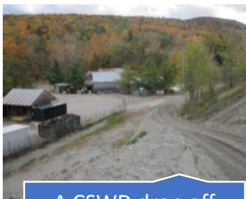
A CSWD drop off facility is on site

The Hinesburg Town Garage recently completed the site redevelopment to upgrade facilities for both the Town Garage and Chittenden Solid Waste District (CSWD) Drop-Off Center. The property is adjacent to Beecher Hill Brook, which is in poor geomorphic condition. The stream has incised and disconnected from its historic floodplain due to channel straightening and subsequent down-cutting. The disconnected stream has high velocities trapped in the channel banks, causing erosion and transporting sediment downstream. Since the Town Garage operations were moved out of the river corridor, this is a great opportunity to reconnect the brook with the historic floodplain so it can naturally meander, drop sediment and nutrients, and provide increased aquatic organism habitat.