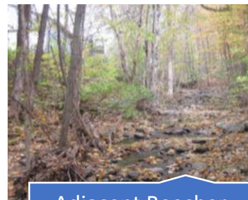
Adjacent Beecher Hill Brook