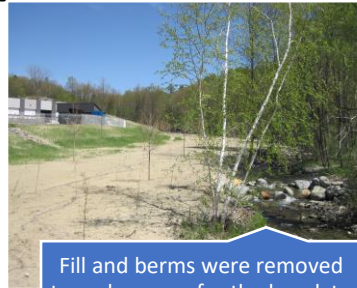
Fill and berms were removed to make space for the brook to spread out onto its restored and planted floodplain.