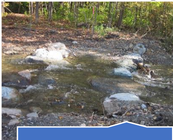
Stones added to raise the level of the river.

Implementation occurred in 2019 and 2020, thanks to a Clean Water project grant from VT DEC and the Town of Hinesburg for tree and live stake plantings. The garage and CSWD buildings and operations have been moved by the Town to make space for this project. A Town bond vote provided funding for removing the infrastructure from the river corridor, native plantings, and stormwater improvements (see AOTS sheet Hinesburg Garage Stormwater Retention).